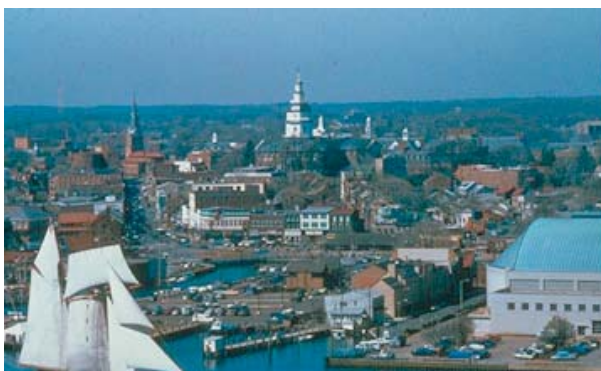
“AMERICA’S SAILING CAPITAL”