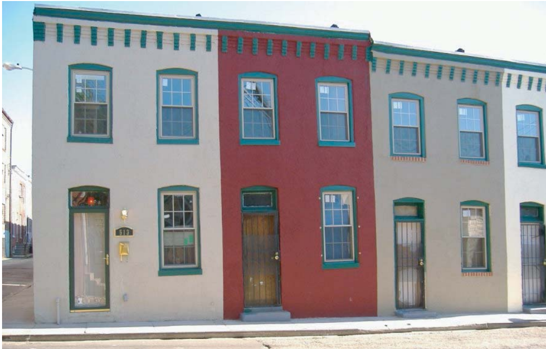
END UNIT ON ROW OF RECENTLY IMPROVED HOMES ON QUIET RESIDENTIAL STREET IN THE HEART OF PIGTOWN.